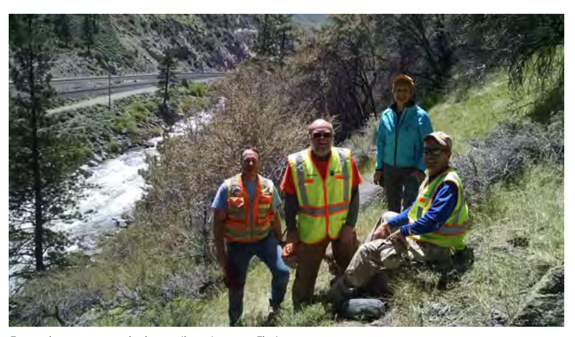
Four volunteers scout the last trail section near Floriston.

The nonprofit Tahoe-Pyramid Trail has begun work on the final section connecting Reno, Nev., through the Truckee River Canyon.