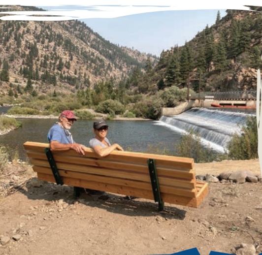
▲ Mike Phillips Memorial Bench at the Fleish Footbridge