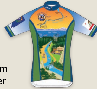
TPT Bike Jersey