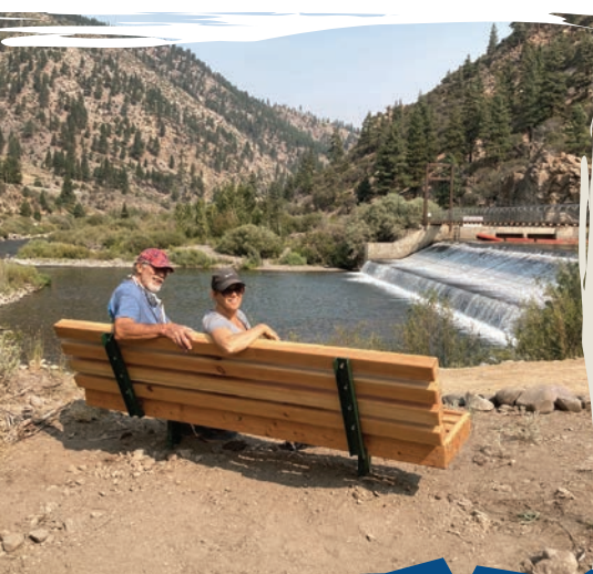
▲ Mike Phillips Memorial Bench at the Fleish Footbridge