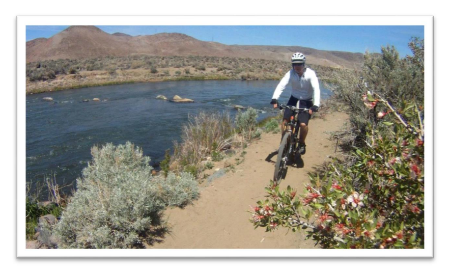
Single track trail on McCarran Ranch built in 2011

With a dirt road serving as a trail across the Mustang Ranch and a trail on the south side of the river through the McCarran Ranch, ten miles of trail opened between Mustang and USA Parkway (the east end of the Tahoe-Reno Industrial Center).