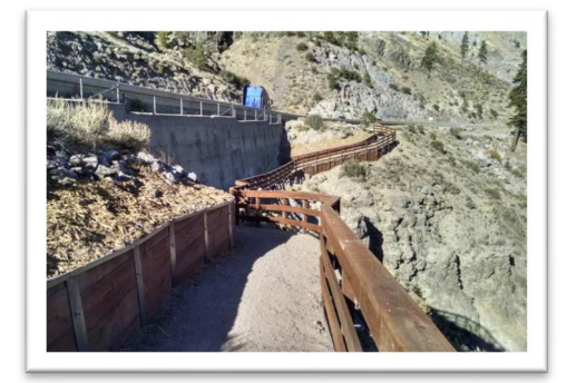
The Caltrans wall had to be traversed without touching it: before and after photos.

The Tahoe-Pyramid Trail group announces in its September 2018 newsletter that work on the last half-mile segment of the trail in the Truckee Canyon is not expected to be complete until 2019. Too many rocks and a shortage of lumber and steel hindered construction. However, the first three miles from Hirschdale are open to riders. They can connect eastbound via I-80's shoulder.