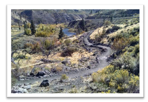
Summer 2018: 1.25 miles of single-track trail built west of Floriston

Richard May Construction wins the contract to build the last segment of the trail in the Truckee River Canyon after building previous trail projects in the canyon. The two miles west of Floriston is considered the most difficult trail section by far. Here the trail is being built beneath and alongside a steep, sloped curve on I-80.