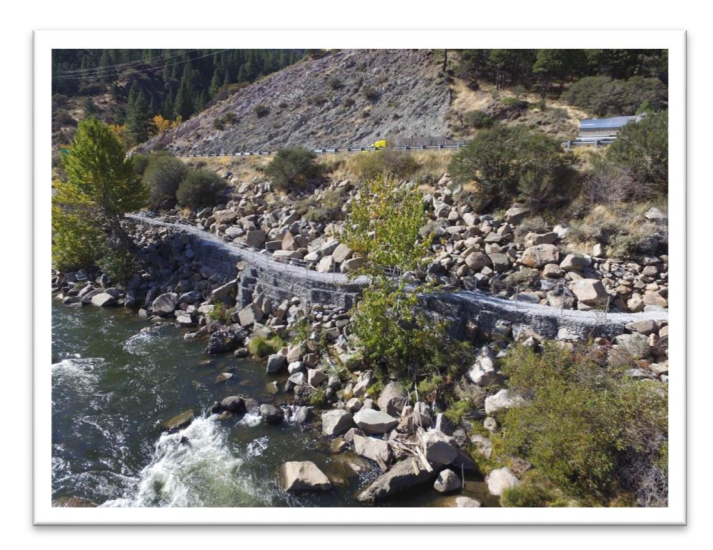
2016 trail built through boulder field near Farad by installing 300 cubic yards of rock in gabion cages.

The two-mile gap in the trail east of Farad was almost completed by September 2015, involving difficult trail building and stabilizing the trail through a vertical field of boulders just east of Farad. Rocks and boulders were placed here by Caltrans for erosion protection when Interstate 80 was built. With this gap filled in 2016, a much easier ride has now been created for those wanting to reach Fleish Bridge than the hilly approach from Verdi – an 11-mile round trip on relatively flat land next to the river. Access to the trail is at I-80 freeway exits at Farad and Floriston.