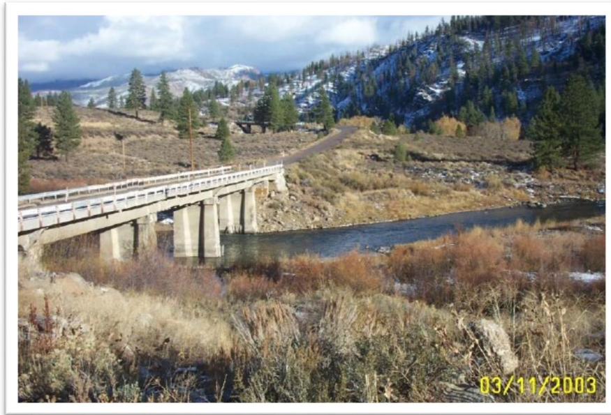
Old Highway 40 bridge at Hirschdale, once slated for demolition by Nevada County, a key part of the Tahoe-Pyramid Trail

On the west end of the Truckee Canyon, the Nevada County Board of supervisors voted in October 2014 to save the old Highway 40 Hirschdale bridge to provide access to the trail and river to hikers, bikers and fishermen. Combined with the Fleish Bridge, the two bridges will make it possible to open up the entire 12-mile canyon. “Eventually,” said Phillips, people in Truckee “will be able to ride their bikes all the way to Reno. “