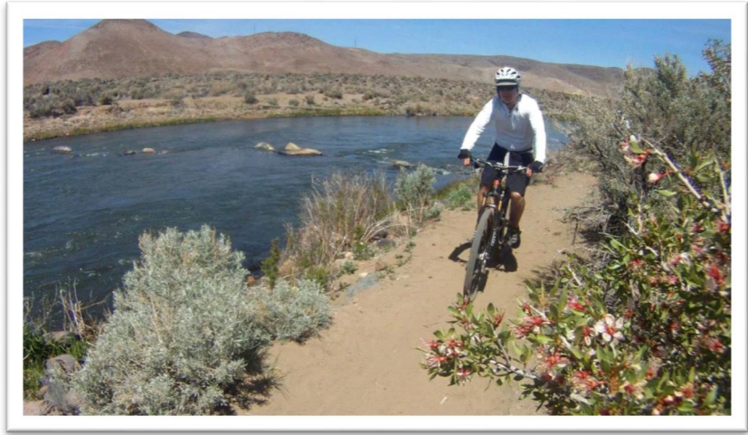
Single track trail on McCarran Ranch built in 2011

With a dirt road serving as a trail across the Mustang Ranch and a trail on the south side of the river through the McCarran Ranch, ten miles of trail opened between Mustang and USA Parkway (the east end of the Tahoe-Reno Industrial Center).