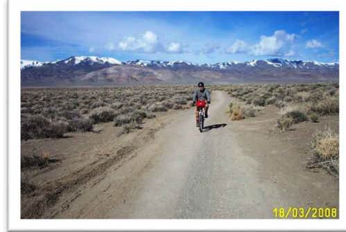
2008 Rez trail—south end near Wadsworth and high bluff section near Gardella Ranch

It took until 2008 to complete the 24-mile “Rez Trail.” Since then, an annual ride in October called “Ride the Rez” still occurs for cyclists to witness fall colors.